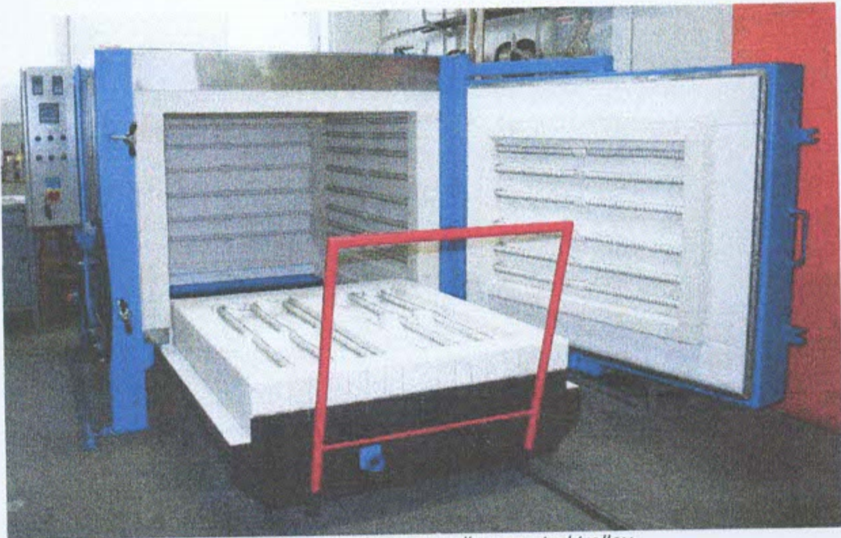
Image showing manually operated trolley